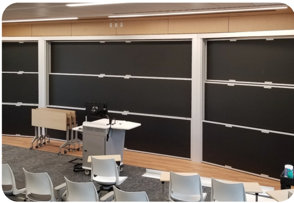
Vertical Sliding Systems