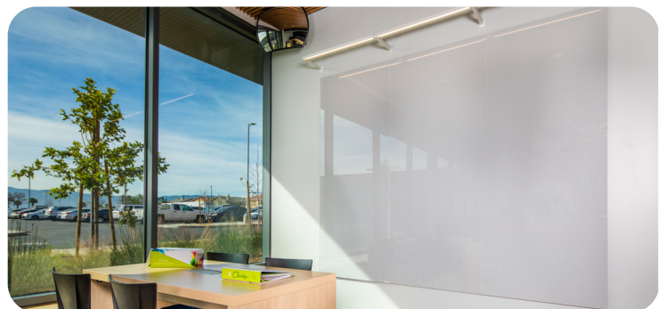
Frameless LCS 3 Porcelain and Glass Markerboards