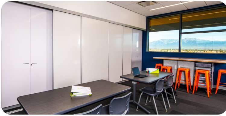
LCS 3 Porcelain Sliding Wall Systems