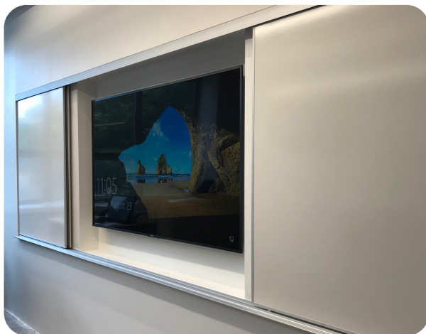
Horizontal Sliding Systems