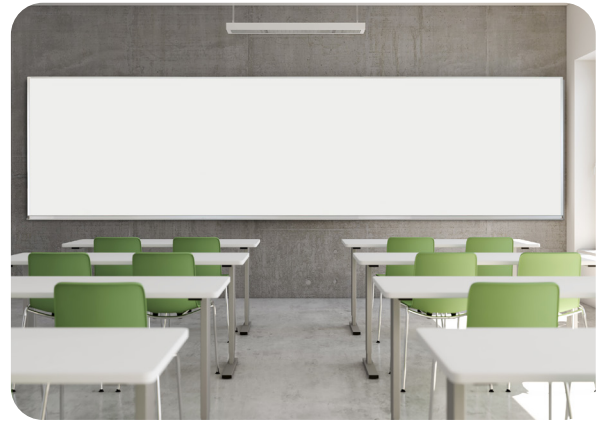
Dry Erase Markerboards