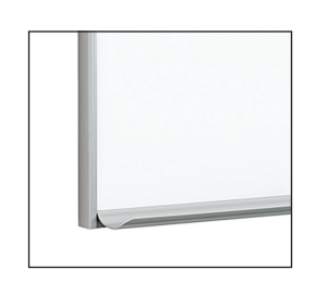
Concept Trim Detail