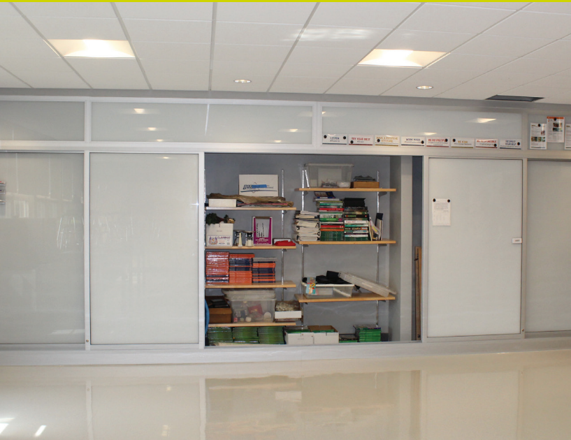
Shown with customized trims, locks, and top framed glass panels