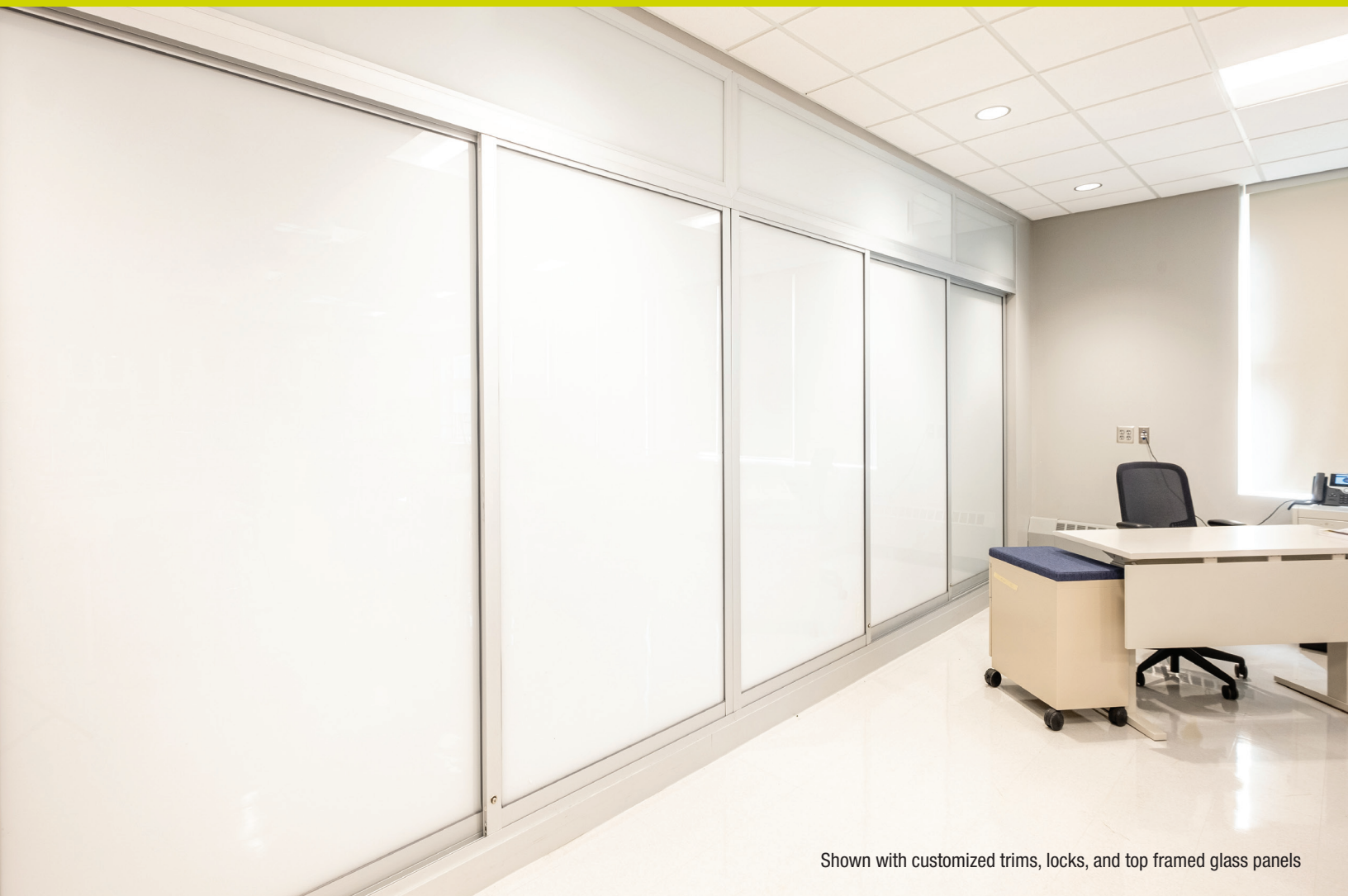
Shown with customized trims, locks, and top framed glass panels