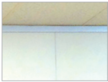
3/4" Face Trim Mounting Detail