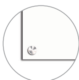
Standoff Through Mount